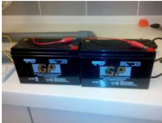
Figure 7: Sealed lead acid battery

In this project, the charging process is usually stopped after a voltage is reached at certain amount[13]. It is recommended to rest the battery a minimum of one hour before charging or discharging. However, in the short term it is fine to cycle the battery without a rest period. Normally, Lead-acid batteries are rated for a 20-hour discharge. The current that will discharge the battery from fully charged is about 13.8 volts to fully discharge around 11.5 volts in 20 hours is called the C20 rate [9].