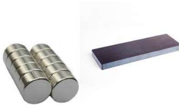
Figure 4: Types of magnet