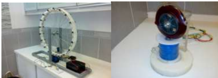
Figure 1: Bedini SSG based on original design Figure 2: Bedini SSG replication design

Bedini SSG design is one of the crucial part that need to be constructed with correct material chosen with minimum cost. A good construction and material chosen will give a good result to this project.