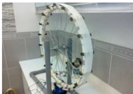
Figure 6: prototype of original Bedini SSG rotor

It is worth noted that anything round and non-magnetic can be used as a rotor[10]. For example, skate board wheels, with a little grinding or machining of the rubber to accommodate the magnets can make a good 3 or 4 pole rotors. Basically smaller diameter, 3 or 4 pole rotors run at higher RPM and draw less current like 6 pole rotor. This may be an important consideration in keeping the current draw down, below the critical battery C20 rate, on the smaller batteries[11]. In addition, it is a wise precaution to wrap some kind of heavy duty strapping tape with the little strings imbedded in it, or even electrical tape around the perimeter of the rotor as a back-up to gluing of the magnetsin.