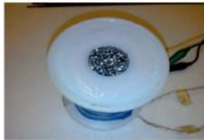
Figure 5: Coil Core

The coil core is metal rod that stuffed in the middle of the coil winding. Normally, it stuffed with welding rod. Other materials can also be used provided the rod compatible to react with the magnet. If the materials retain any magnetism when the magnet is taken away, then they are not suitable. If both south and north attract to both core ends, then such core issuitable.