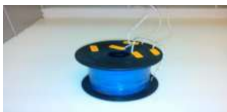
Figure 3: Bifilar Coil for Bedini SSG

Bedini bifilar winding is two winding wound on the spool with parallel together. This winding is usually used in making for a few types of winding for transformer[8]. There are two names for winding wound on the spool together, one is trigger coil and the other one is power coil. Both coil wire come in form of Standard wire gauge (SWG) unit. This Bifilar winding is one of the main parts that has to consider when built SSG. This winding is important to produce electromagnet when connected to the SSG circuit.