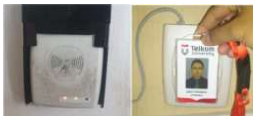
Figure1: Installed RFID Reader

RFID Reader is used to user terminal to perform transaction. RFID Reader also called interrogator, which is device for detect and read RFID tag. This device give radio energy to passive RFID tag. RFID Reader can be handheld or stationary. Handheld reader is reader that can be operated on the move while stationary is reader who settled in one place. In this work, we use stationary high frequency reader which is has 10-15 cm operation range for read the tag comply with ISO 14443A standard. The reason is already a lot of tag in the form of card circulating in the society and can be used for attendance recording. RFID Readers, which are used also support the TCP/IP protocol that must have an Ethernet interface. RFID Reader will directly communicate with the server via the Local Area Network (LAN) so it does not need a PC on every node as a bridge of communication. Examples of RFID Reader, which are mounted can be seen in Figure 1 below: